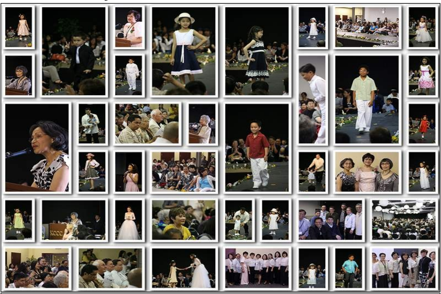
"The beauty of a child is so special. Their short childhood is a great reason to celebrate them everyday."

quence of the fashion show was presented in beautiful white and colors of purple and red, tones of blue and turquoise, apple green, yellow, pink and hues of fuschia and navy.